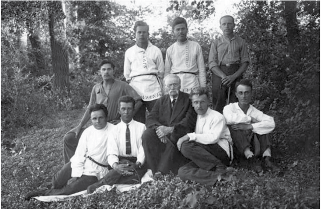
Fig. 2. Members of the DniproHES expedition, 1929 (after Попандоупо 2012, с. 266).

say that the 40,000 exhibits found by the expedition change the primitive history of mankind in South-Eastern Europe, so the entire scientific world is following the work of the expedition" (42).