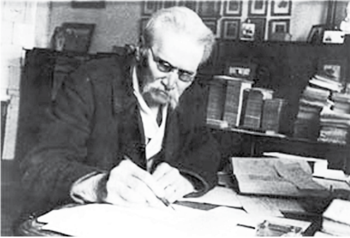
Fig. 1. Dmytro Ivanovych Yavornytskyi