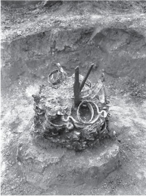
Fig. 8. Voznesensky "treasure" (photo negative) Scientific Archive of the IA NASU, f. 18)

iron horse bridles, as well as buckles and rings from horse harnesses. Two or three pairs of stirrups and bridles were ornamented with silver and gold notching; over 1400 gold items, almost all exclusively in the form of decorative plaques decorated with grain and scrollwork, and some stamped and molten metal lumps weighing over 1200 g. In general, the plaques were intended to decorate military belts and harnesses for horses. The finds also included gold rings, shackles, and other parts from saber scabbards, quivers, bows, saddles, and other equipment. Among the silver items, some stand