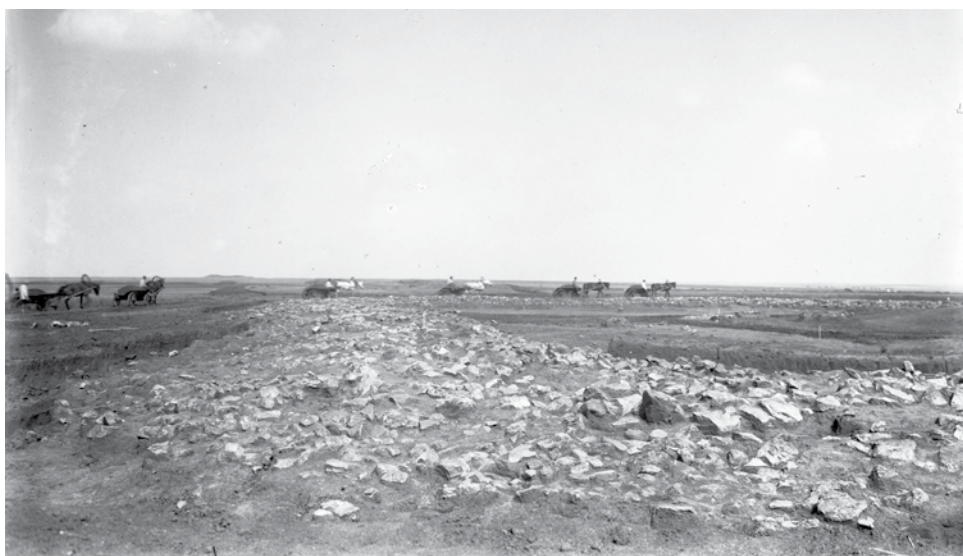
Fig. 7. Exploration of the stone rampart, 1930 (photo negative, Scientific Archive of the IA NASU, f. 18; no. 317)

squares (27, c. 9). All 1195 squares were studied by him sequentially.