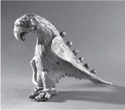
Fig. 10. Silver top of the Byzantine military standard in the form of an eagle. An artifact from the Voznesensky "treasure", Zaporizhzhia Museum of Local Lore

hopeless situation, and the surviving soldiers had to burn their military insignia (eagle and lion) along with their dead commanders and comrades so that they would not be taken by the enemy" (9, c. 61). Among the finds were the figurines of an eagle and a lion, which V. A. Hrinchenko defined as signums — signs, emblems that the cohorts, maniples, and centuries of the Ancient Roman army had (9, c. 48). One of the highlights of the Zaporizhzhia Regional Museum of Local