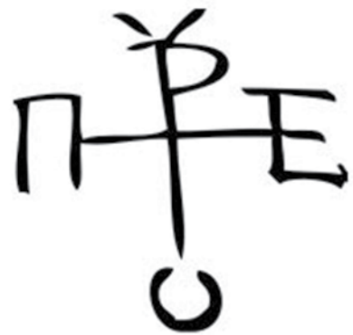
Fig. 12. The stamp on the chest of a silver eagle figurine and its drawing